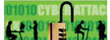
The perpetrators have been found to use tactics such as phishing emails, fake login pages, and malicious attachments to gain unauthorised access to sensitive information

Amid tensions between India and Pakistan, the digital world hasn't been spared, and cyber-security risks remain high. The Cyber Crime Wing in Chennai has issued a press release alerting citizens about the elevated risk of cyber-attacks, particularly from 'State-sponsored advanced persistent threats', known for targeting government agencies, military personnel and critical infrastructure.