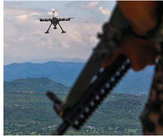
IN THE WORKS. Industry representatives said the proposed scheme will replace the now-defunct PLI for the drone sector

A major thrust area, they pointed out, will be to develop a counter-drone manufacturing ecosystem in the country. Technically, a counter-drone system is